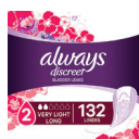
Always Discreet Incontinence Liners, Very Light, Long, 132 ct