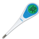
Vicks SpeedRead Digital Thermometer with Fever InSight Technology