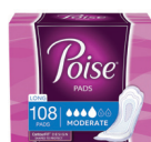
Poise Incontinence Pads, Moderate, Long, 108 ct