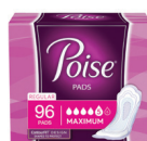
Poise Incontinence Pads, Maximum, Regular, 96 ct